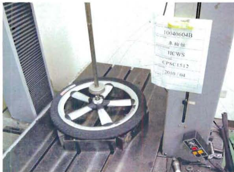
Fig. 2 Static test for wheel assembly

The tested wheel assembly has no cracks and visual fracture, and the wheel still rotated smoothly. The permanent deformation of the tested wheel axle is 13.11mm. Appears in the middle of two plastic pieces 0.9mm gap. The test shown in Figure 2~3 .