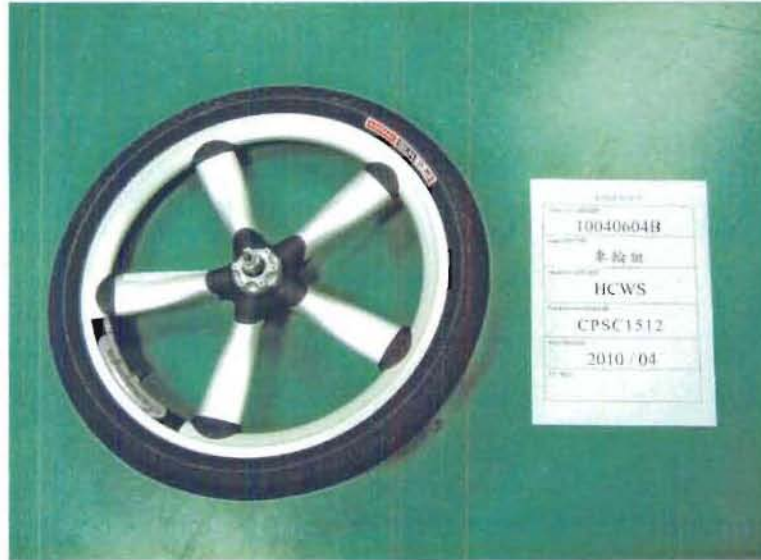
Fig. 1 Test sample

5.1 Test sample : As shown in Fig. 1, before the test, function is normal.