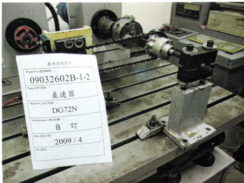
Fig. 2 Torsion test

Torsion of the driveshaft reach 1129.54 kg-cm, its angle is 37.8°. After the test, the differential device has not damage on the test situation. Test procedure as shown in Figure 2.