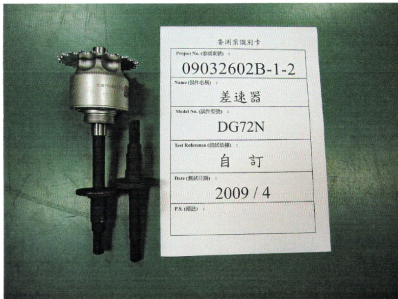
Fig. 1 Test Sample